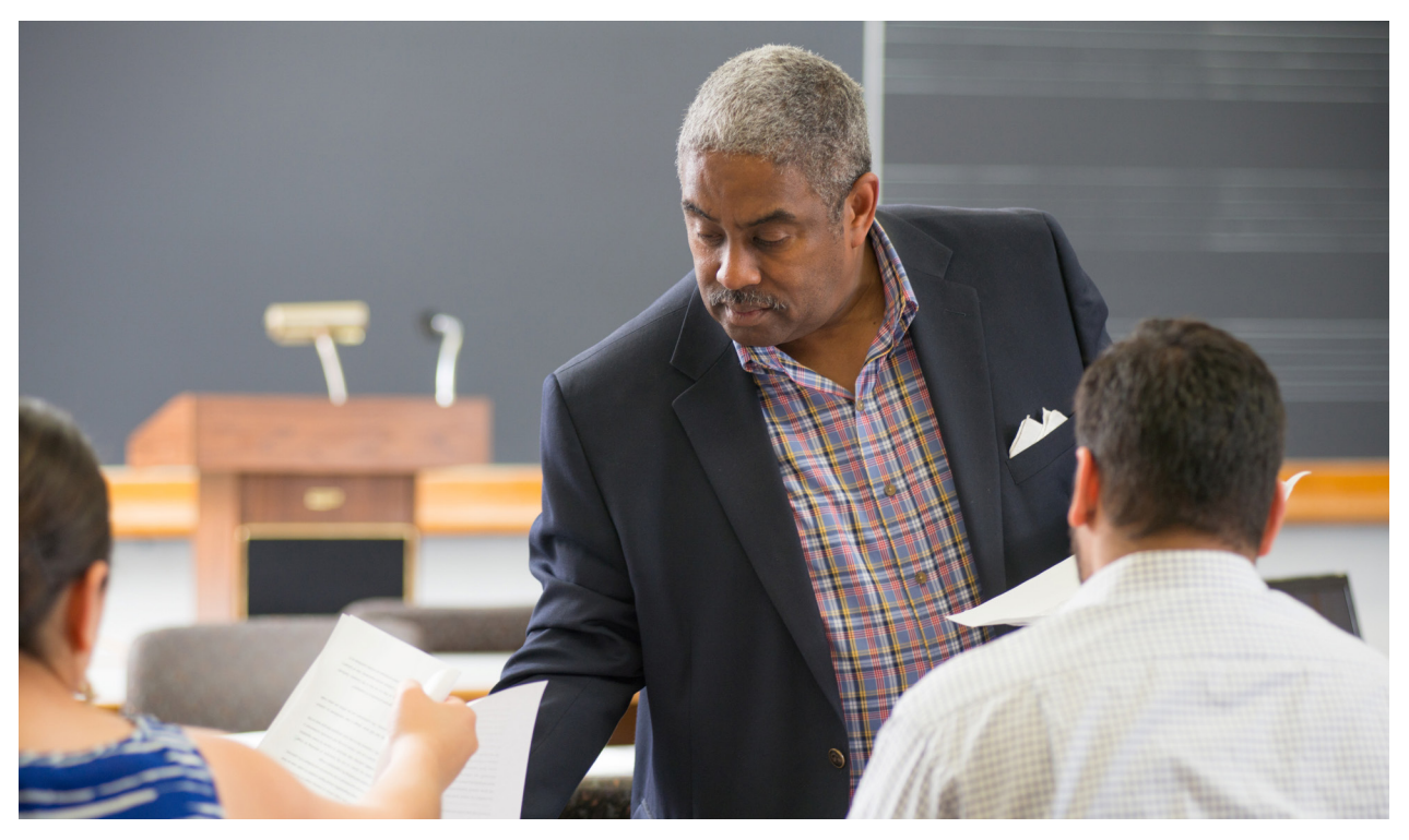
Which plan is best for you? The decisions you make today regarding your retirement plan can have a significant impact on your future. Consider the options carefully.

You must draw a monthly income from your ORP account. Your ORP provider will deduct the monthly insurance premiums from your income.